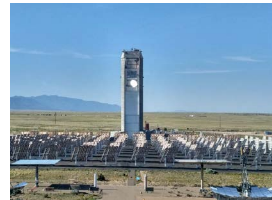
Fig. 2: On-sun testing of the bladed receiver design at the National Solar Thermal Test Facility, Sandia National Laboratories, USA.