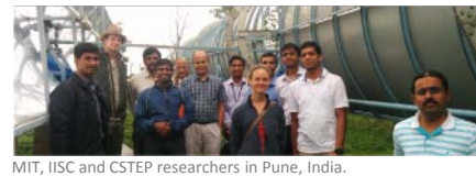
MIT, IISC and CSTEP researchers in Pune, India.

30 bi-national exchanges for 10 weeks each