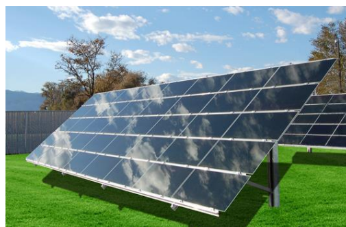
A Typical thin film photovoltaic array

As per Bloomberg analysts, Indian solar plants using silicon-free panels emerged as the best performer in the first year of its operation: