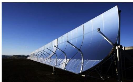
Concentrated Solar Power Collector