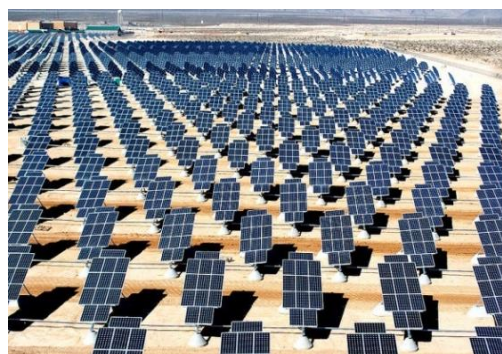
Photovoltaic array installed in US