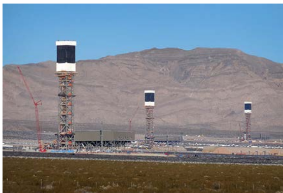
Three Power Towers in the Ivanpah Plant