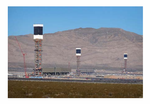
Three Power Towers in the Ivanpah Plant

• The cost of installation is about $5,500 per kilowatt which is more than a coal-based plant, but less compared to a nuclear power plant.